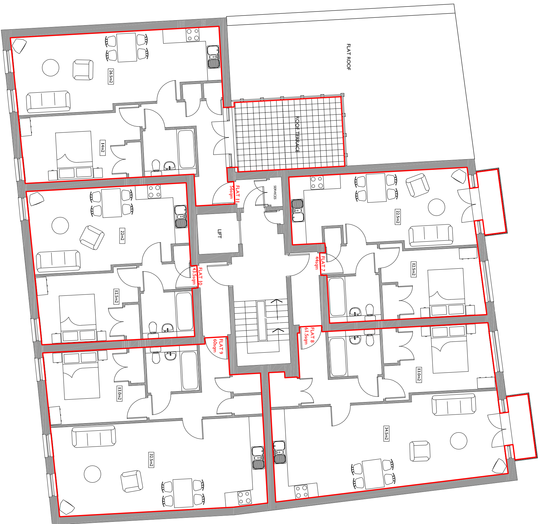
SECOND FLOOR PLAN SCALE 1:100 (@A3)