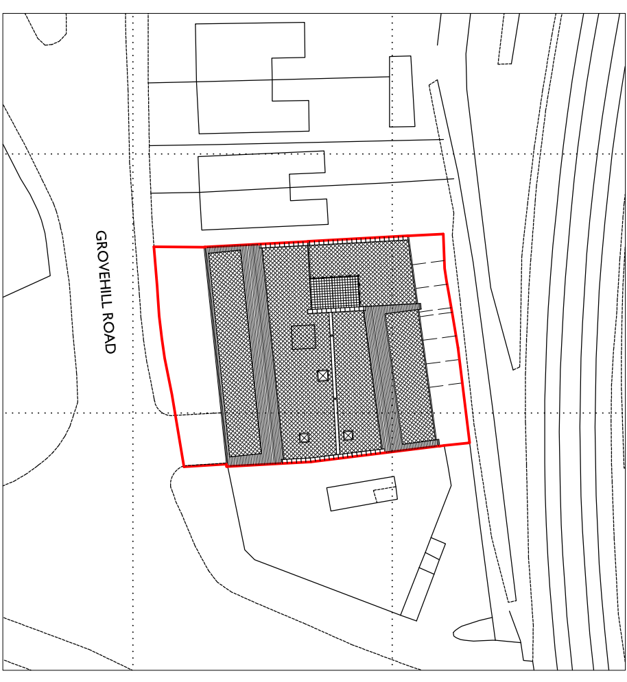
SITE LOCATION PLAN SCALE 1:500